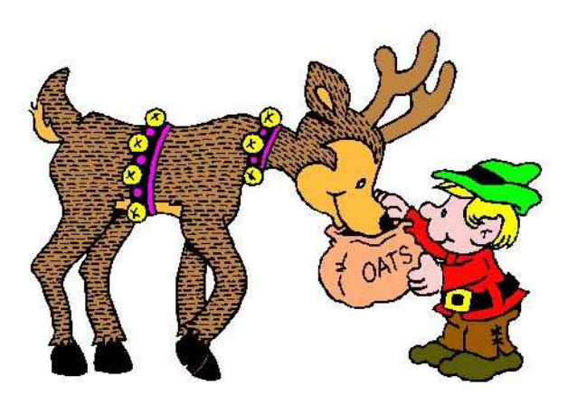
TO ALL- A VERY MERRY CHRISTMAS AND A HAPPY NEW YEAR!

TO ALL THE VOLUNTEERS OF THE SASKATCHEWAN BASEBALL HALL OF FAME AND MUSEUM-A HUGE 'THANK YOU" FOR SUPPORT.