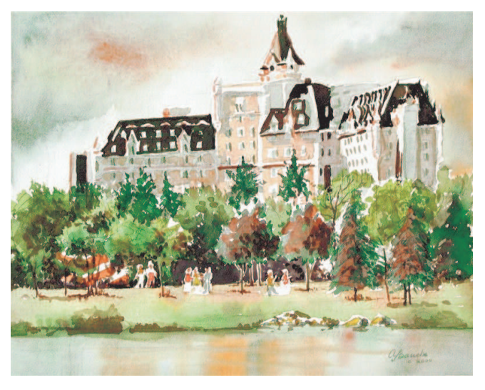
Print # A716