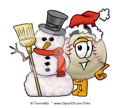
Merry Christmas and Happy New Year!

Email-saskbaseballmuseum@sasktel.net OCTOBER/NOVEMBER/DECEMBER 2010 VOLUME 27 #4