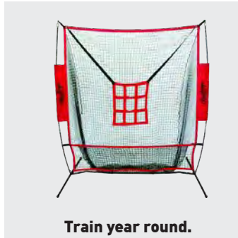
Train year round.