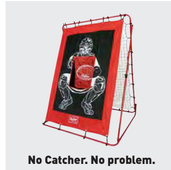
No Catcher. No problem.